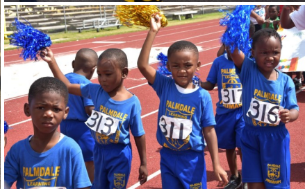
Above: Hundreds of preschoolers take part in various activities in celebration of the 20th Annual Preschool Week

This year the Ministry celebrated the young preschoolers under the theme, "A Blast From The Past: 20 Years!". Students representing various preschools marched to the beat of The Royal Bahamas Defence Force Band and The Bahamas Department of Corrections Band as they displayed their uniquely themed costumes to judges and onlookers.