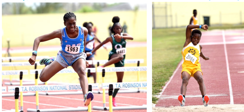
Above: Highlights from the 2024 National Track and Field Championships

Approximately 1,600 student athletes from throughout the nation began competition at the 2024 National Track and Field Championships on Thursday, April 11th, 2024 at the original Thomas A. Robinson Stadium, under the theme: "Ringing In a New Era of Sporting Excellence."